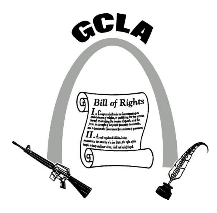
G.C.L.A. NEWS April - June 2024

Postmaster: Time Sensitive Material Enclosed